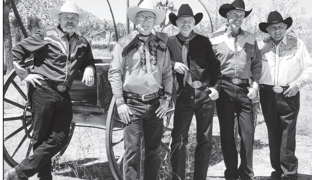
The Sons of the Pioneers Western singing group

one-of-a-kind musical event in Blairsville - October 27th at 2 PM at the UCS Fine Arts Center, the Sons of the Pioneers western singing group will be performing.