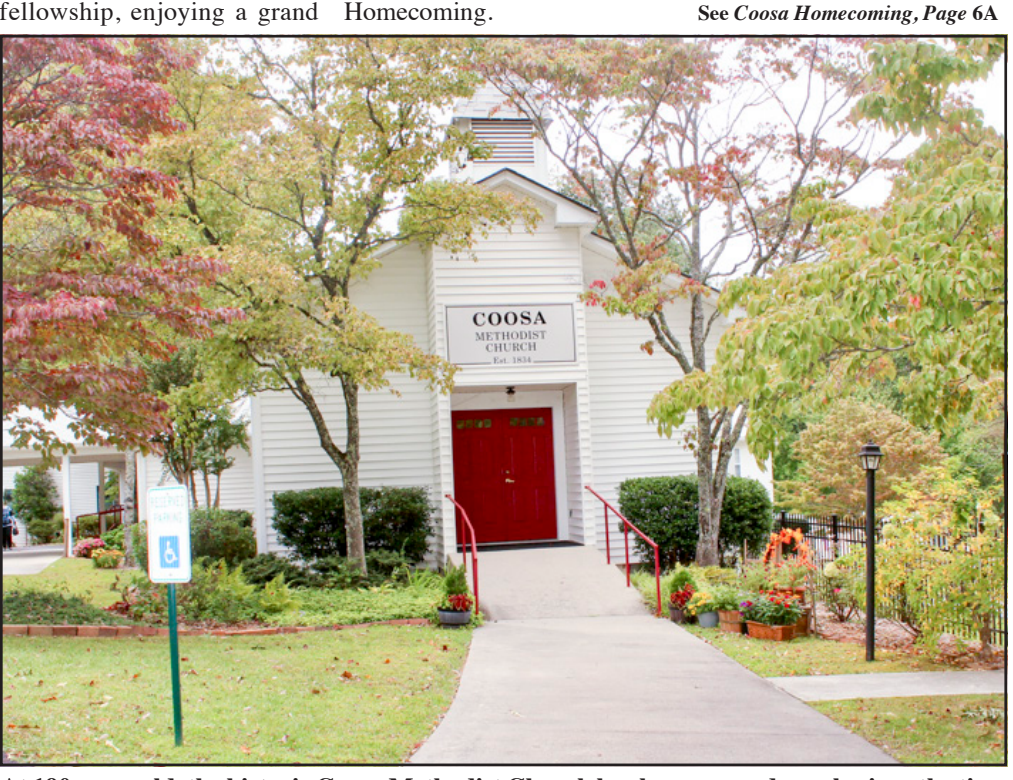
At 190 years old, the historic Coosa Methodist Church has been around nearly since the time of the county's founding and is showing no signs of slowing down.

By 1865, the church was erected at its present location on what is now known as Mulky Gap Road. It was originally described as "simple, Spartan and utilitarian but nestled in a beautiful location (and) accessible to the members by foot or by horse and buggy." See Coosa Homecoming, Page 6A