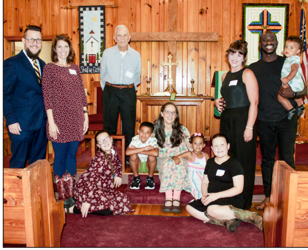
Local families gathered this month to celebrate Coosa Church's historic past and bright future.

"We are a forward-looking people, always walking forward," he added, urging Coosa's family to always follow the Lord's path ahead as they forge their own stories in faith.