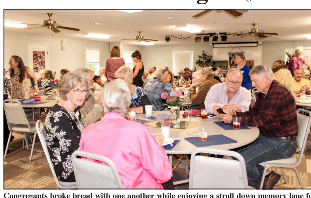
Congregants broke bread with one another while enjoying a stroll down memory lane for the 190th Homecoming of Coosa Methodist Church on Sunday, Sept. 15.